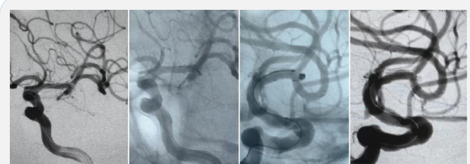
Figure 2: DSA shows the postoperative aneurysm was no longer visible and completely occluded.